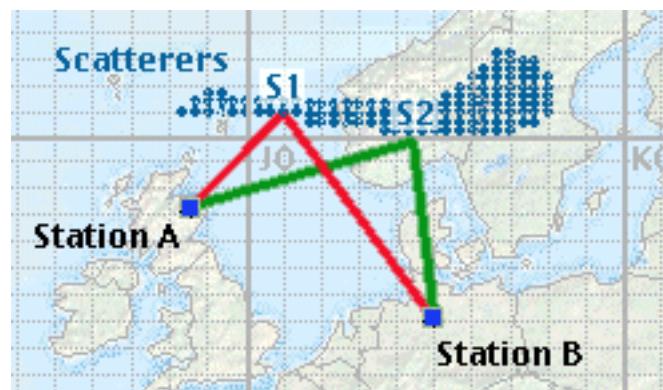
Figure 1. Red: Aurora propagation path which separates into a short leg (A-S1) and a long leg (S1-B). Green: propagation path with two legs of equal length, i.e. A-S2 and S2-B.

Assuming station A denotes the transmitter and station B the receiver, the path loss along the uplink A-S1 is relatively small resulting in a high field strength of the scattered radiowave at the position S1. However, the scattered radiowave must travel a long way from S1 to the receiver B corresponding to a high path loss along the downlink. If station B takes over the function of the transmitter in the Aurora QSO, we find a different scenario, i.e. the field strength of the scattered radiowave is relatively low at S1 because the incident radiowave